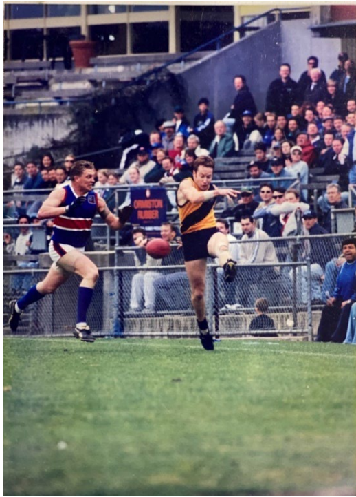
Inside/out barrels, on the run, on the opposite foot are hard to do