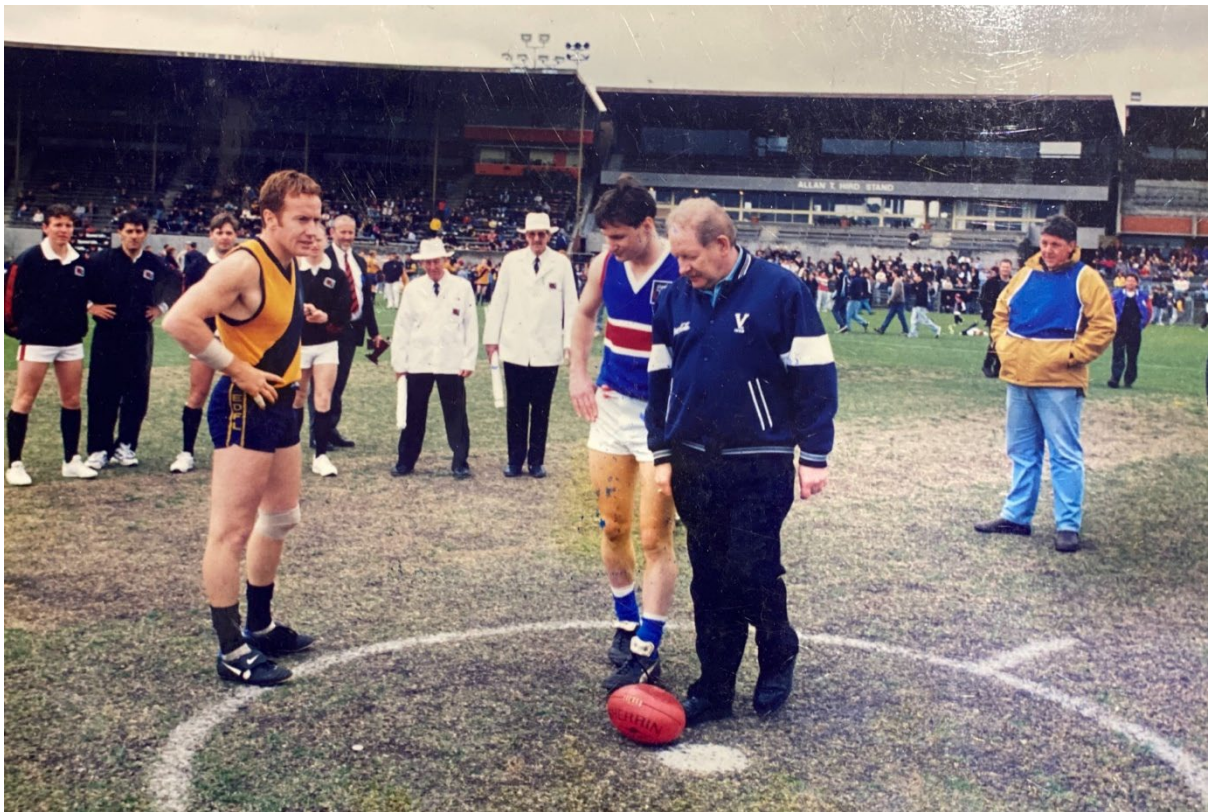
Coin toss which we won & never looked back