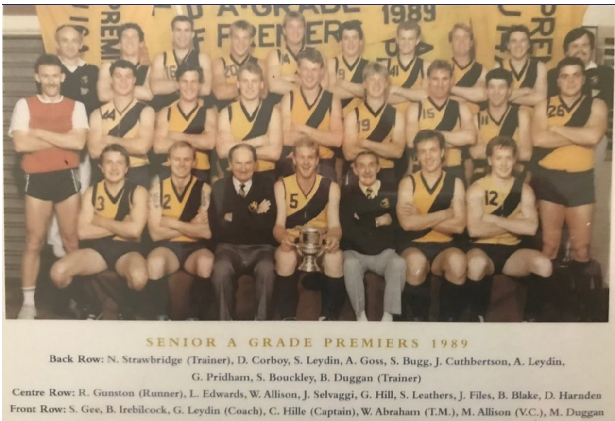
Every Premiership player came through juniors